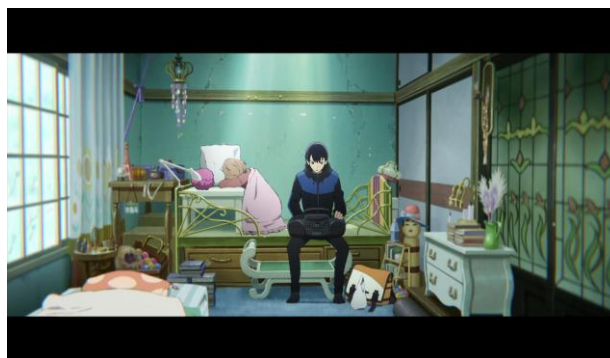
Picture 6. Tsuneo Who Still Visits Josee