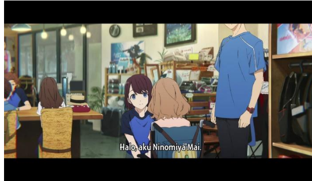
Picture 3. Josee's Unexpressed Jealousy