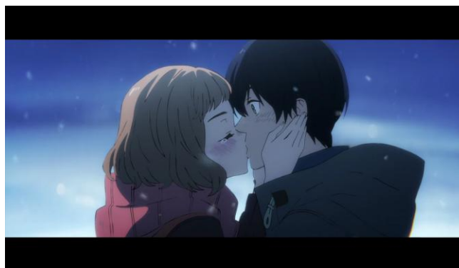
Picture 5. Tsuneo Has a Passion to Meet Josee

In the film, an emotional connection through physical interaction is depicted, particularly in the scene from 1:30:48 to 1:32:44, where Tsuneo searches for Josee and ultimately finds himself in a similar situation as during their first encounter. At that moment, Josee is the first to notice and quickly wakes up, concerned for Tsuneo, who is resting on the street amidst a heap of snow.