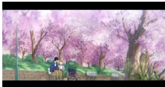
Picture 8. Tsuneo Returns to Meet Josee