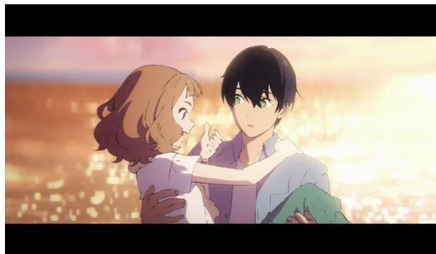
Picture 1. Josee Starts to Trust Tsuneo

In Sternberg's Triangular Theory of Love, intimacy signifies the feelings of closeness, connection, and a profound emotional relationship with another person. This aspect is evident in partnerships that feature shared understanding and transparency, allowing individuals to freely express their feelings, aspirations, and dreams. In the film Josee the Tiger and the Fish (2020), the aspect of intimacy is prominently displayed; initially, Josee is portrayed as shy, hesitant, and skeptical, causing her world to feel restricted because of her personality, and their first meeting is awkward as a result of Josee's desire to retreat. However, Josee gradually begins to open up to Tsuneo, particularly at the timestamp 24:50 to 25:38, where Tsuneo encourages Josee by carrying her closer to the ocean so she can experience the sensation of the salty seawater.