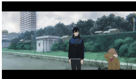
Picture 7. Tsuneo Who Chose to Stay With Josee