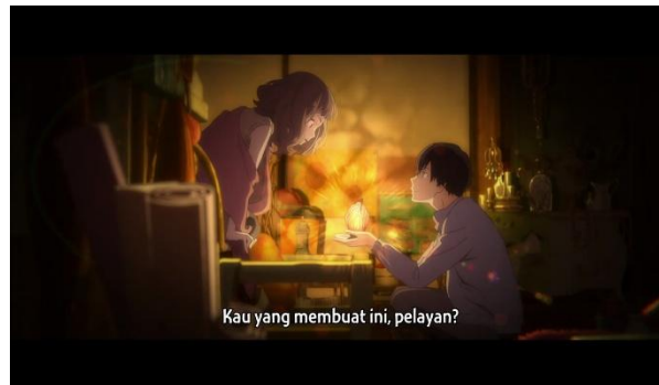
Picture 2. Start to Open Their Hearts to Each Other